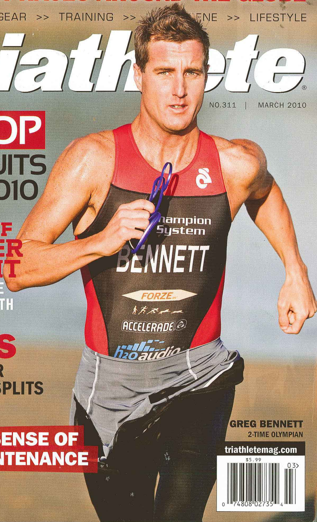
GREG BENNETT 2-TIME OLYMPIAN